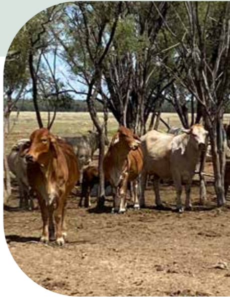
Rosemount Grazing "Rosemount" Barcardine QLD