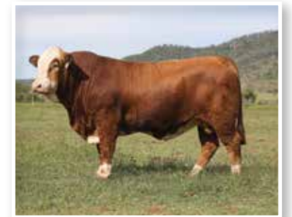
Yerwal Estate Rockhampton (P) Sire BAR 5 SA Glover 854T

We pride ourselves in producing sound, commercially focused cattle that have the maturity and muscle patterns, doing ability to adapt and thrive in most parts of Australia.