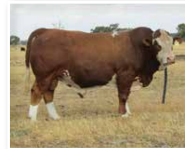
Yerwal Estate Ripper Sire BAR 5 SA Glover 854T

150 Simmental and Angus Bulls will be offered by Yerwal Estate at their annual on property sale, the Queensland Simmental Bull Sale and other selling outlets in 2023