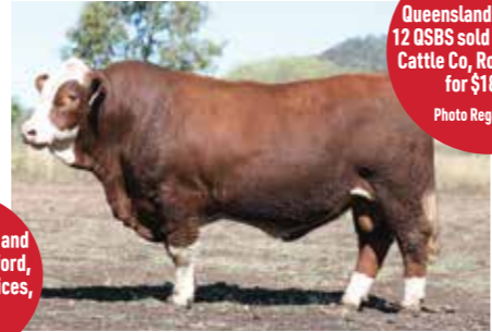
Yerwal Estate Queensland Q005 Lot 12 QSBS sold to Rockview Cattle Co, Rockhampton for $18,500.

Nutrien Ag Solutions is an authorised representative of MARSH ADVANTAGE INSURANCE