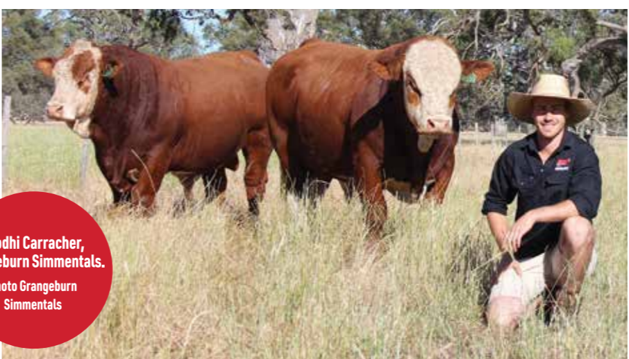
Brodhi Carracher, Grangeburn Simmentals.

"We do what we would want someone else to do for us if we were in their shoes."