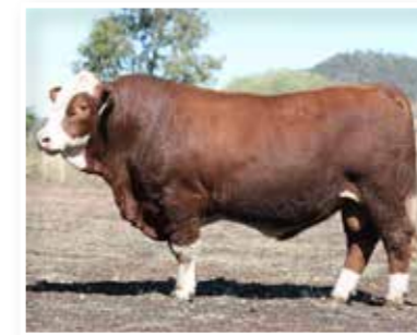
Yerwal Estate Queenslander Sire Glen Anthony Y-ARTA AY02