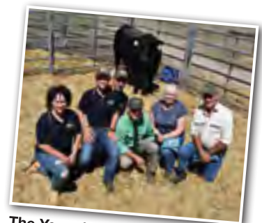
The Yerwal team at their on farm Simmental Bull Sale in 2021

We were wrapped in our on farm sale this year to have three bulls from our sale to go into studs. Yerwal Estate State of War Q300 went to Elite Cattle Co, Yerwal Estate Quality Kid Q004 to Tennysonvale Simmentals and Mt. Mooney Q-Tip Q027 went to Rellum Farms Simmentals.