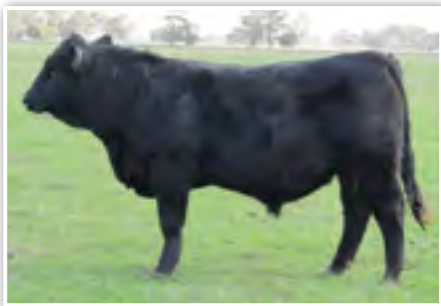
AMOP R310 Yerwal Estate Riddler Sire LFE The Riddler