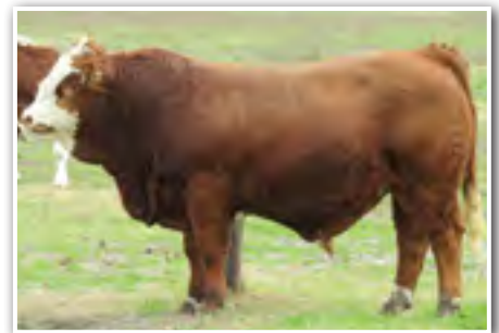
AMOP R315 Yerwal Estate Rip Tide Sire Bar 5 SA Glover

We pride ourselves in producing sound, commercially focused cattle that have the maturity and muscle patterns, doing ability to adapt and thrive in most parts of Australia.