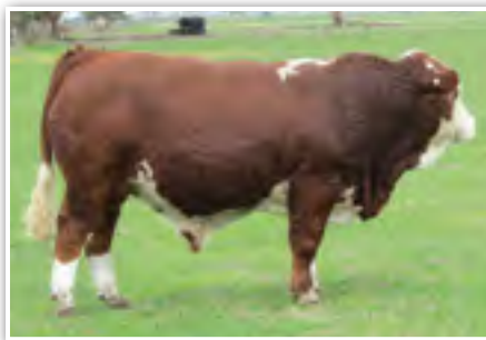
AMOP R311 Yerwal Estate Roger Ramjet Sire Bar 5 SA Glover